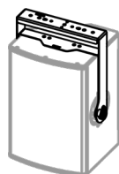
VBEE-12 Vertical bracket